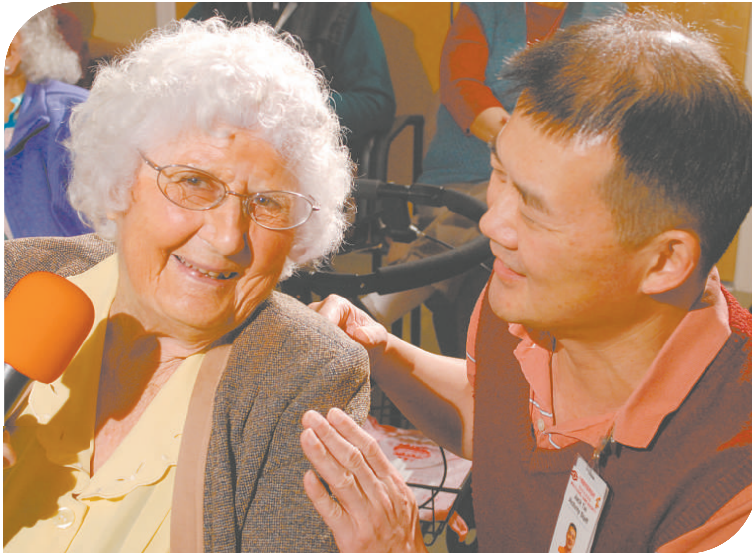
IRENE FOUNTAIN AT AUSTIN HARRIS RESIDENCE