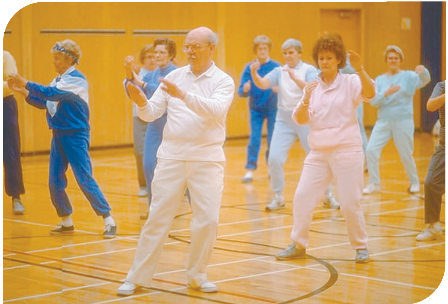
TAI CHI IS ONE OF MANY EXERCISES THAT HELP WITH BALANCE

Often when a senior has had a fall they will develop a fear of falling and avoid going outside and participating in activities. Unfortunately this is self-defeating as it increases the risk of falling by reducing strength and balance. Exercise is key to maintaining strength and balance, and